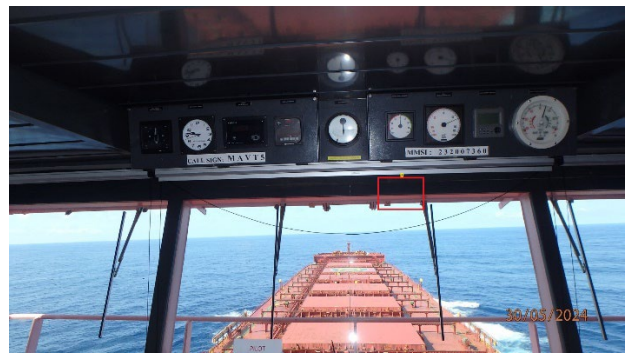
Proposed location on the Bridge