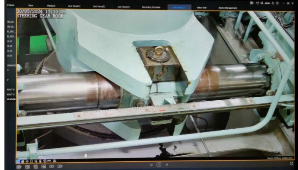
Sample of real-time feed to a CCTV Monitor in the wheelhouse.