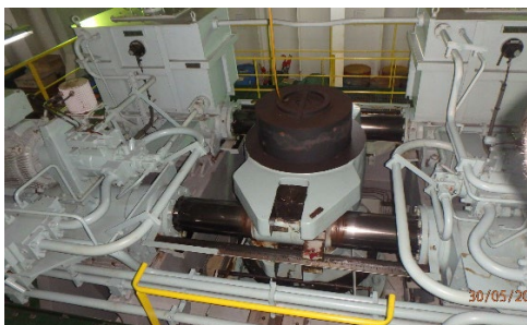
View from the Proposed location FWD on the Phones and Gyro repeater panel