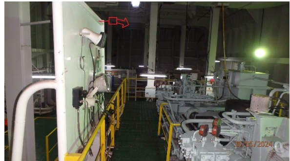
Proposed location of camera on the Phones and Gyro repeater panel