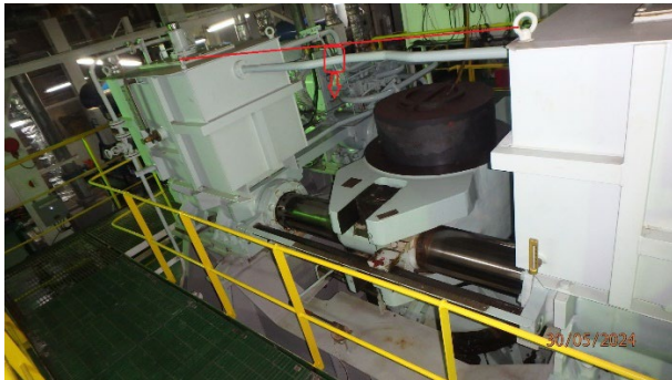
Proposed location AFT on the LO tanks